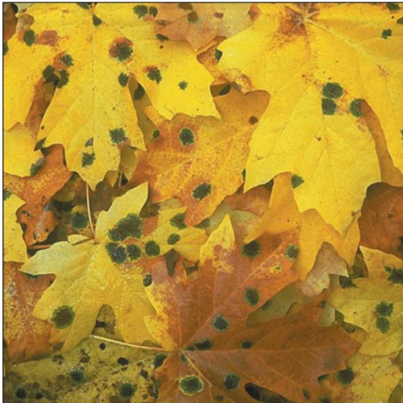
Mold growing on fallen leaves.

This document is available on the Environmental Protection Agency, Indoor Environments Division website at: www.epa.gov/mold