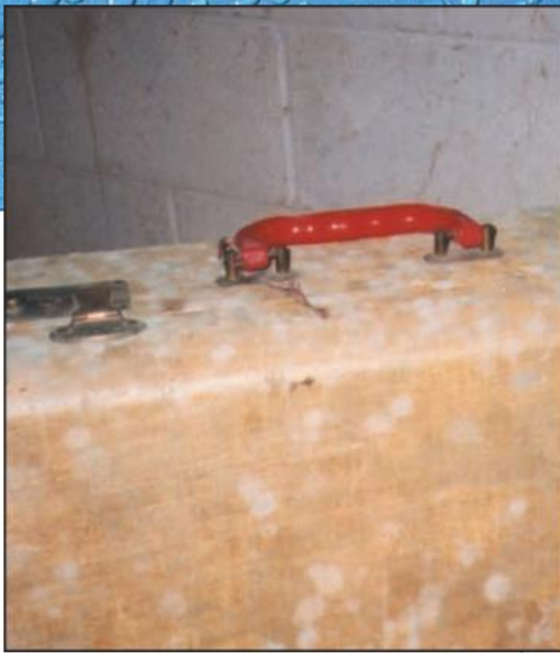
Mold growing on a suitcase stored in a humid basement.

It is important to take precautions to LIMIT YOUR EXPOSURE to mold and mold spores.