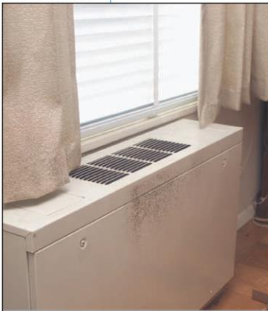
Mold growing on the surface of a unit ventilator.