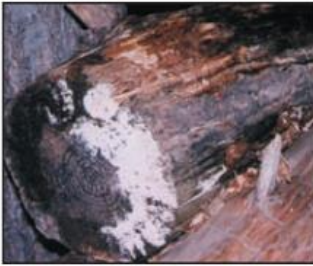
Mold growing outdoors on firewood. Molds come in many colors; both white and black molds are shown here.

Why is mold growing in my home? Molds are part of the natural environment. Outdoors, molds play a part in nature by breaking down dead organic matter such as fallen leaves and dead trees, but indoors, mold growth should be avoided. Molds reproduce by means of tiny spores; the spores are invisible to the naked eye and float through outdoor and indoor air. Mold may begin growing indoors when mold spores land on surfaces that are wet. There are many types of mold, and none of them will grow without water or moisture.