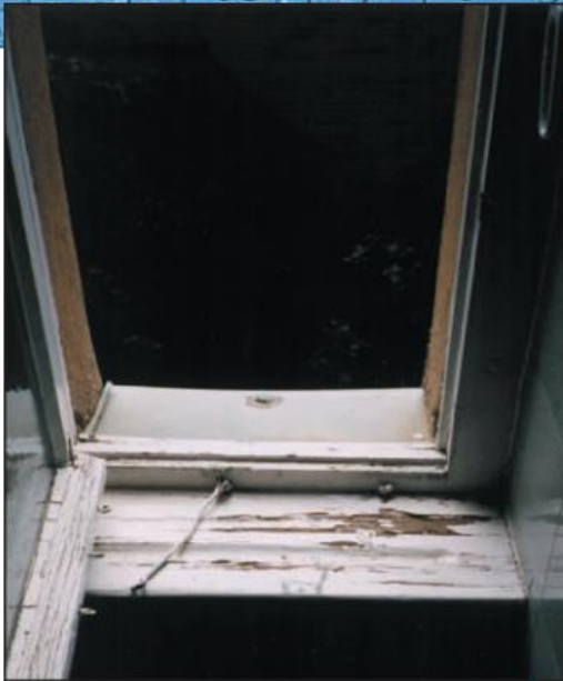
Leaky window – mold is beginning to rot the wooden frame and windowsill.

If you already have a mold problem – ACT QUICKLY. Mold damages what it grows on. The longer it grows, the more damage it can cause.