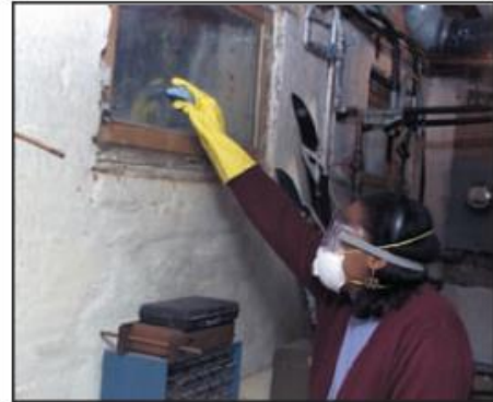
Cleaning while wearing N-95 respirator, gloves, and goggles.

■ Wear goggles. Goggles that do not have ventilation holes are recommended. Avoid getting mold or mold spores in your eyes.