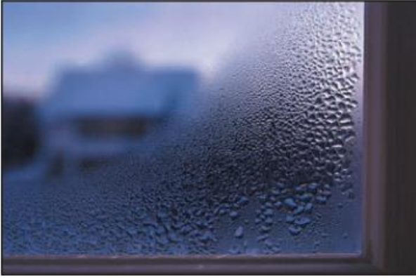
Condensation on the inside of a window-pane.