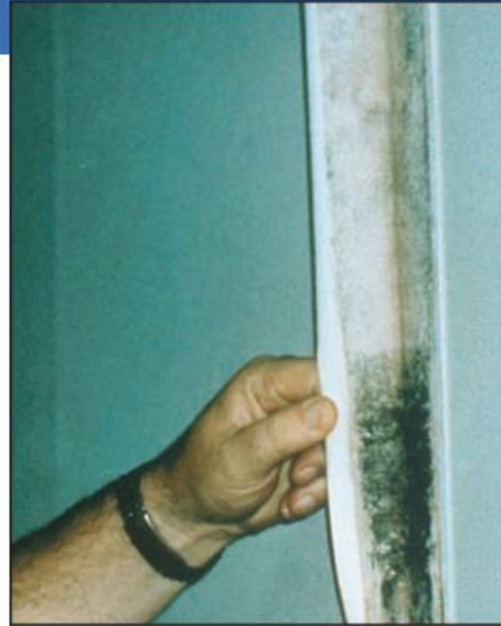
Mold growing on the back side of wallpaper.

Suspicion of hidden mold You may suspect hidden mold if a building smells moldy, but you cannot see the source, or if you know there has been water damage and residents are reporting health problems. Mold may be hidden in places such as the back side of dry wall, wallpaper, or paneling, the top side of ceiling tiles, the underside of carpets and pads, etc. Other possible locations of hidden mold include areas inside walls around pipes (with leaking or condensing pipes), the surface of walls behind furniture (where condensation forms), inside ductwork, and in roof materials above ceiling tiles (due to roof leaks or insufficient insulation).